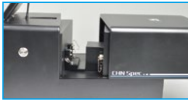
Open measurement area, no limit on sample size.