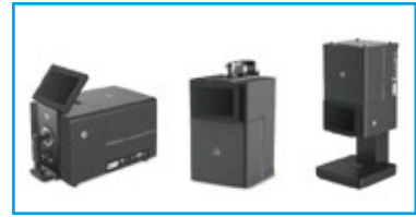
Instrument is with 7.0 inches TFT touch display screen with good human-computer interface.