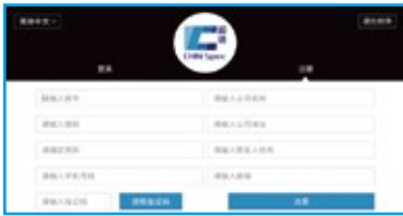
Intelligent instrument software, support operation without PC.