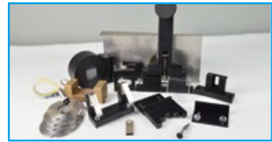
Different kinds of standard accessories and optional accessories to meet the measurement requirements of different materials.