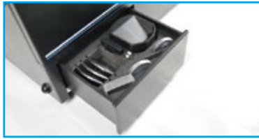
Perfect combination of accessories and instrument body, convenient for protection and storage.