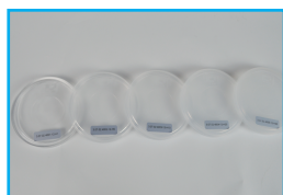
▲ Haze Standards