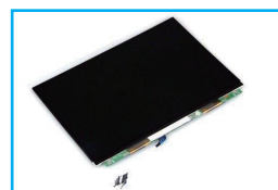
▲ LCD screen