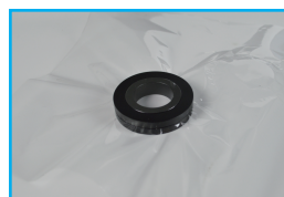
▲ Film Fixture