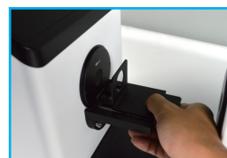
▲ Liquid Fixture