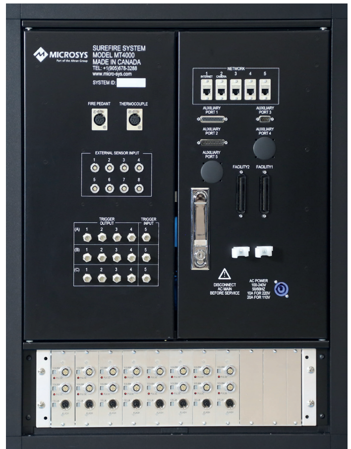
Rear panel of the SureFire G6 System showing connections

SureFire G6 maintains all test setup information in its own Access database, and can integrate with customer databases for traceability and quality management.