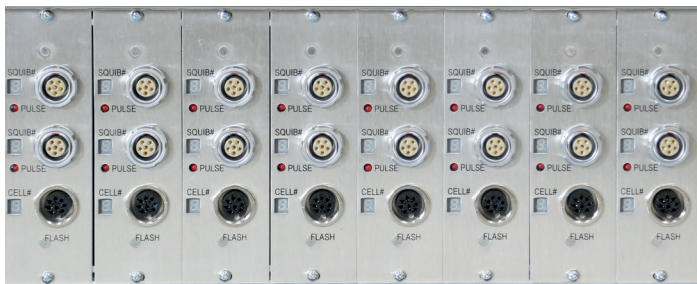
Detailed view of connections